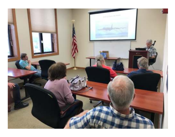
Aviation History Program

Less than a month till school is out; and the moment we all have been waiting for... Summer Break! When summer break begins so does Summer Reading Program. Our staff has been working hard preparing for the kickoff event on June 2<sup>nd</sup>. With the weather improving so has the attendance in the library and with programs. Coldwater had a total of 4,398 people visited the library in April; which is a 39% increase from the previous year. The in-person computer questions/internet use was 278 for April and that is a 47% increase from last year. One of our most popular clubs is Anime night. Teens get together and share